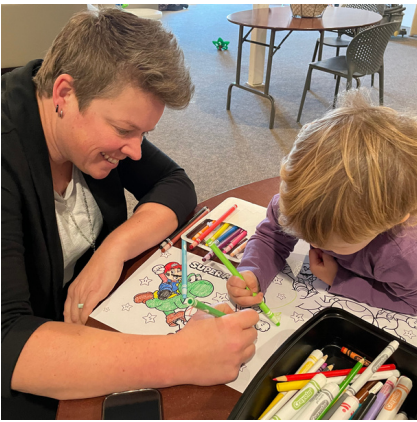
COLOURING TOGETHER DURING DROP-IN