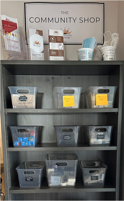
COMMUNITY SHOP SHELVES