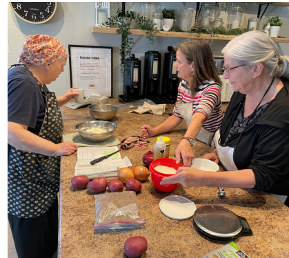
MAKING FOOD TOGETHER