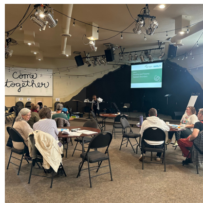
MENTAL HEALTH FIRST AID COURSE