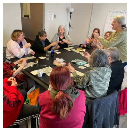
QUILT MAKING WITH GRANDMA'S GROUP