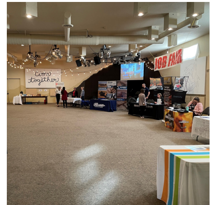
REGIONAL CONNECTIONS JOB FAIR HELD AT TCE