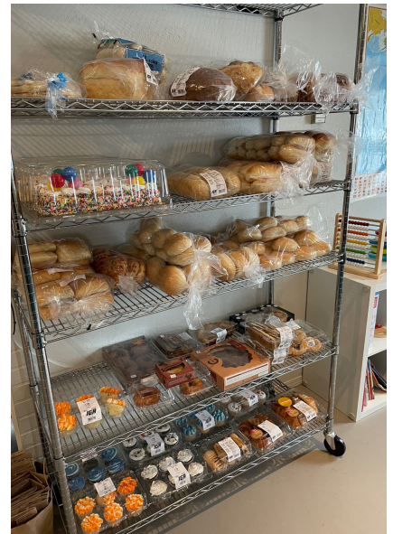
TCE FOOD RESCUE SHELF

WE ARE SO GRATEFUL FOR THE DONATIONS WE HAVE RECEIVED TO DATE, BOTH MONETARY AND TIME. VOLUNTEERS AND FINANCIAL RESOURCES ARE ESSENTIAL TO HELP ALL OF OUR PROGRAMS RUN.