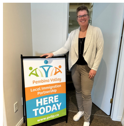
TARA WITH PVLIP